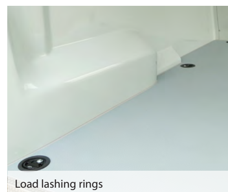
Load lashing rings