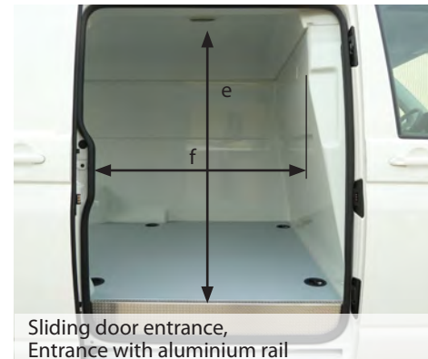
Sliding door entrance, Entrance with aluminium rail