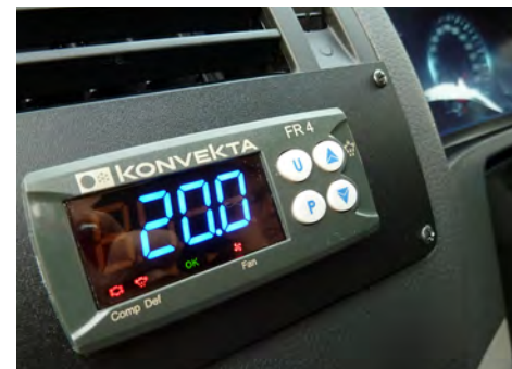
Digital control in the driver's cab