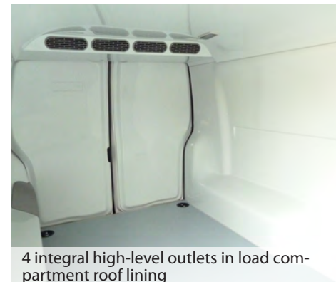
4 integral high-level outlets in load compartment roof lining